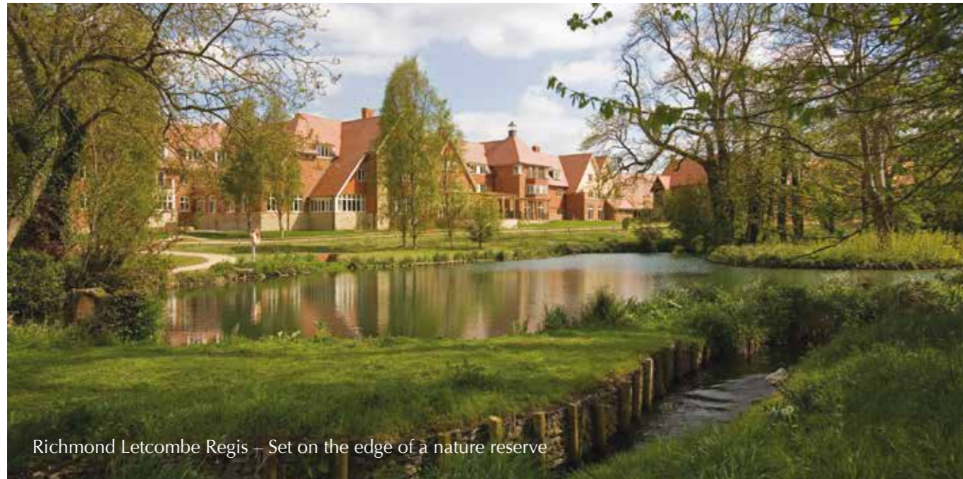
Richmond Letcombe Regis – Set on the edge of a nature reserve